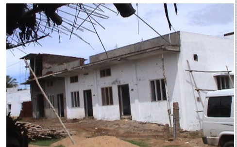
Recent picture of the front of the building of the orphanage, taken on 10/24/05

The orphanage project is still going on and is turning out to be a very beautiful home for orphans. Unfortunately there have been some delays in the process of the building work. Due to not having enough laborers at the right times, and the increase of prices due to the tsunami last year the work may take a few more months to be finished. We hope to have children in the orphanage by early next year. We still need to provide a well water system. This will include a deep bored well and a water tank. Also still needed are a septic tank and a wall around the building for security. To those who are sponsoring a child or the orphanage, your patience is so appreciated right now even though you have not yet seen your child. Your support is crucial to provide beds and much needed supplies for the orphanage. We are beginning to search out orphans who are in the most desperate need so we can get the paper work finished so the children can come to the orphanage as soon as it is finished. Sponsors who will pledge monthly gifts of any amount are also greatly needed to keep the orphanage running and to provide for a cook and child care workers. Please prayerfully consider sending a love gift to help us to finish this urgent project.