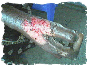
Infected hand of a leper.

The Lord has put a great burden and compassion in the heart of Independent Church In India (ICII) to reach out to those with leprosy that are the most shunned and ignored throughout India. To many of these desperate souls, ICII is their only hope. As the Lord has provided, ICII has given out numerous leprosy compassion packs that contain a Bible, Christian literature, sandals made for lepers, a mat to sleep on, a blanket, soap and towel, toothpaste and toothbrush, bandages, eatables, and more. They also have provided food, clothing, eyeglasses for the nearly blind, and they pay the bus fare for those who are coming to church each week. Independent Church in India's goals are to keep making a difference in the lives of lepers. This ministry's goal is to build homes for homeless lepers. At their own leprosy colony, they can lead a normal life and even work. ICII's goal is to buy enough land so they can grow their own fruits and vegetables. At their new home, we can get medical provision for them and get them on a medicine that will cure their leprosy. They can live the rest of their lives here feeling wanted, live without starving or begging, and feel the love of Jesus in their lives. We want to build them a church here and have daily Bible studies so they can grow in the Lord and have the void in their life filled with the love of the Lord Jesus Christ.