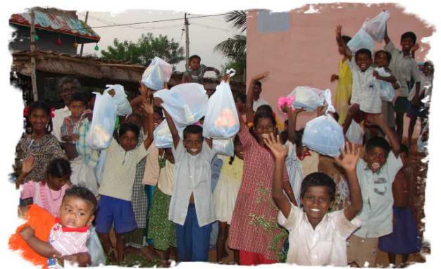
Happy children who received a gift pack last Christmas season.

You Can Bring Joy to a Child in India this Christmas - Last Christmas season ICII was able to give out four hundred children's gift packs to the poor children in the remote villages of India. This Christmas season ICII would like to double that and bless more children with these gift packs. These packs will be a great witness of Christ's love to both the children, and their parents. This will be the first time many of these children will have ever received a Christmas gift. These packs are only $4 each and will contain a New Testament Bible, a Gospel tract, a blanket, a toy, cookies, a notebook and pencil, and a toothpaste and a toothbrush. (Please see enclosed flyer for more information)