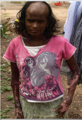
A young girl with leprosy.

The doctor's told him that he cannot be healed and that he may die soon. The team went to him and shared the Gospel to him and told him about Jesus' love. That man received the Lord and the team prayed for him. The man said, "I was so scared about when I die because I was a Hindu and I didn't know what would happen when I die. Now I am so happy and I have hope I will go to heaven". His wife also accepted the Lord and shared thankfully, "No one would come to us or touch us before. This is the first time we ever knew that someone cares about us". They shared that their only son made them leave his home and he never came to see them in the ten years they had been in the colony.