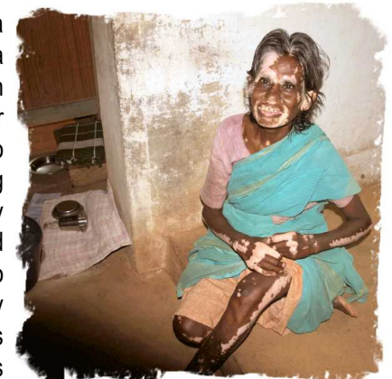
This woman with leprosy was filled with joy to hear about the love of Jesus!

pendent Church in India to him. This day was the best day of his life! This day, he felt unconditional love, peace and joy like never before. He heard the Gospel of the Lord Jesus Christ for the very first time and he experienced the greatest gift of all... salvation in Jesus Christ! For over the past month, the ICII Gospel team has been visiting leprosy colonies and reaching the homeless and poor lepers in the cities with the Gospel. ICII's goal is to preach the Gospel in every leprosy colony, hospital and wherever leprosy victims may gather in Tamil Nadu, the southern state of India.