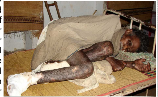
At many leprosy colonies, the patients are not cared for. This man is very weak, and near death.

Just imagine, a person who has leprosy... That person may have nothing in this world, except for the rags he or she is wearing. That person with leprosy feels hated, despised, and rejected, not just from society, but their own families. Most people in their society think they are a cursed person, so no one will help them. These people have no job or money, and no one wants to get near them because they are considered an untouchable person. This unfortunate person with leprosy feels intense pain, extreme loneliness, severe hunger and cold, tremendous grief and emptiness. They feel lots of pain from their disease, but no money to buy medicine or even wrap their many infected sores and wounds. Day after day they feel no relief emotionally or physically. They feel no purpose in life, and may even hope for death to come soon, but due to their Hindu belief, death to them is fearful and uncertain as to what may come next. They have been chased out of their homes and their villages, because their families and neighbors no longer want them around. They have been told to go somewhere else to die, so they may have wound up homeless on the streets or in a government-run leprosy colony or hospital. Wherever they are, they are not treated well. Their only means of survival is to go and beg each day, hoping that enough strangers walking by will have mercy on them to give them enough pocket change so they can eat that day.