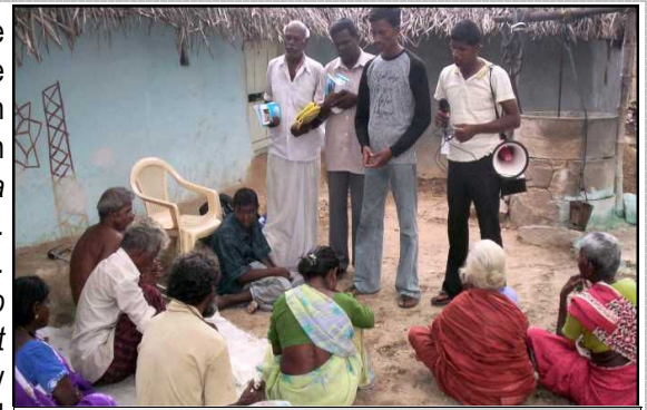
ICII's missionaries ministering to a group of lepers and homeless at a city outreach.

The doctor's told him that he cannot be healed and that he may die soon. The team went to him and shared the Gospel to him and told him about Jesus' love. That man received the Lord and the team prayed for him. The man said, "I was so scared about when I die because I was a Hindu and I didn't know what would happen when I die. Now I am so happy and I have hope I will go to heaven". His wife also accepted the Lord and shared thankfully, "No one would come to us or touch us before. This is the first time we ever knew that someone cares about us". They shared that their only son made them leave his home and he never came to see them in the ten years they had been in the colony.