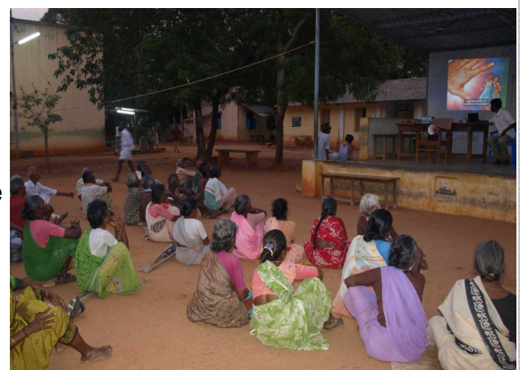
Showing a Gospel video at a leprosy colony through a new video projector.

ever! Through the vision and generosity of a loving supporter, ICII has been able to purchase eight new video projectors for use in village outreach. Thanks to advances in technology, video projectors have become less expensive and produce bright, high quality images. These new projectors are compact and lightweight for easy portability, and have low power consumption. Coupling a projector with a marine-type battery, an AC inverter, and a small DVD player yields a portable video system that the Gospel teams can easily take anywhere and reach large audiences. In the remote villages, curiosity attracts lots of residents and bystanders, who then receive the Word of God. Together with ICII's Word for Word Gospel of John video and our video tract called Jesus Christ: The Risen Lord , these projection systems will provide an effective and versatile set of tools for the ICII Gospel teams to use in evangelism and Bible study.