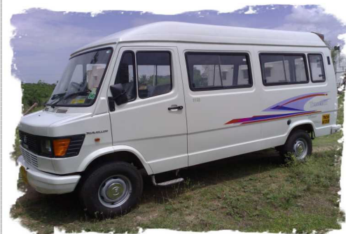
A generous supporter has sponsored this van for the sole purpose of reaching every leper in Tamil Nadu.