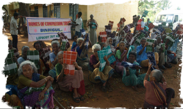
Giving blankets to the Lepers at a colony.