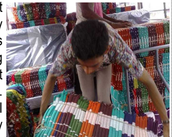
10,000 blankets and 4,000 New Testaments have been sponsored so far to give out in the leprosy colonies and city outreaches.

again. There was now a different officer overseeing both colonies, so they approached him and asked him if they could come and comfort the lepers. This officer allowed them to go into both the colonies! About 50 lepers were at each colony, totaling 100. Through this open door, most all of them accepted the Lord! The Gospel team was so joyful in how the Lord supernaturally opened the door for the Gospel where it had been closed before.