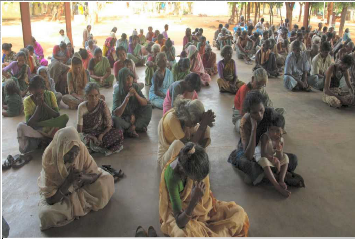
One hundred and seventy-five lepers accepted the Lord at one colony! They are praying to accept Christ!

At every outreach, each leper will receive a blanket. Bibles and Gospel tracts will be given to those who can read. The team will apply medicine and wrap the wounds of those who have been neglected, and they will be prayed for. In the evening, a Gospel video will be shown through a video projector. This will give more lepers a chance to hear the Gospel if they were out begging during the day.