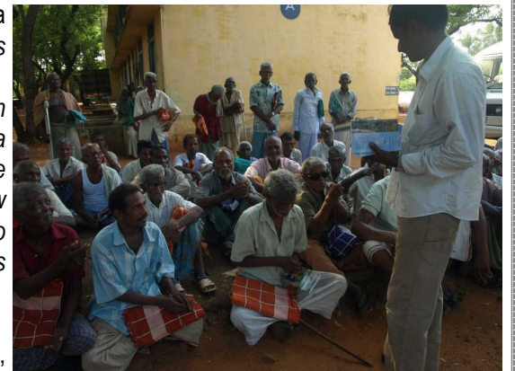
Giving out blankets and Bibles to the lepers.

Some lepers at one of the colonies shared with the team, "We were always worrying about how our lives were because we thought that God has cursed us. We even went to beg in front of Christian churches but we never heard that Jesus loves us because we were never invited to go inside the churches. But today you shared that Jesus loves and died for us. This is so very comforting to us. Today we asked Jesus to forgive us. We are no longer going to worry about our life because we now know that Jesus is with us because he cares for us. We are now going to pray and talk with Jesus everyday, because no one else is talking with us" .