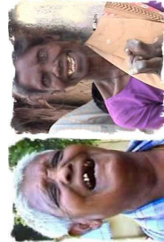
Bringing the joy of Jesus to the hopeless.

ICII has started their own leprosy community called the Promised Land. Each leprosy victim that has come to live at the Promised Land Leprosy Community has been transformed by the love of Jesus, and the tender care of Independent Church in India. Each leprosy friend can live the rest of their lives at their new home feeling wanted and loved.