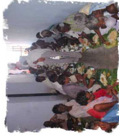
Leprosy victims enjoying a meal.

Each Sunday morning, the saved, the lost, the leper, the poor, the homeless, the lame, the blind, and others, are coming together to worship the living God at ICII's church services. The Lord is sending His revival and touching the lives of those who once had no hope, and transforming them to bring glory to His name. Many come to church who are very weak and have not eaten for days due to severe poverty. Many come with leprosy that have the smell of rotten flesh that needs urgent attention. After the worship service is finished, an all-you-can-eat meal is served to each person. Their infected wounds are lovingly bandaged, and other urgent needs are provided.