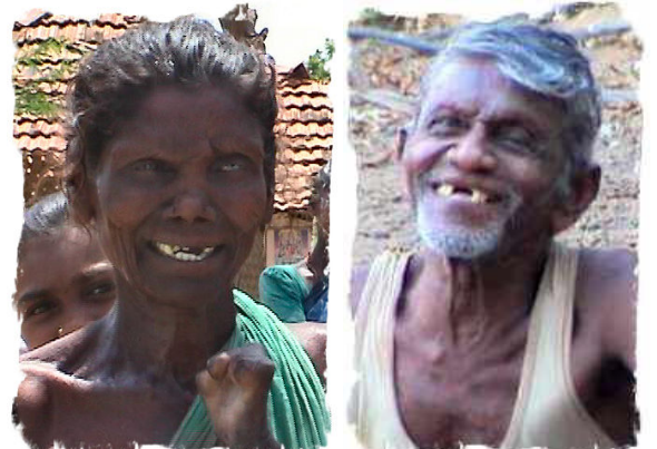
Jesus has brought real hope to these lives that before only knew pain and despair.