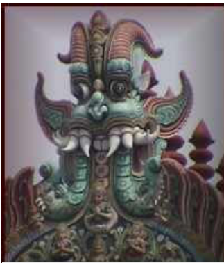
Many Hindu's believe that a person with leprosy has been cursed by their Hindu gods.