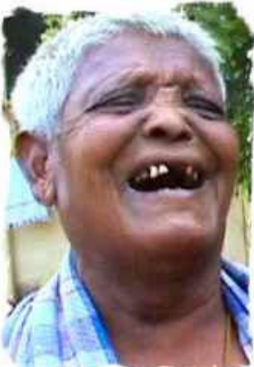
The joy of the Lord is now their strength!

"A person with leprosy lives a life that has been shattered by their disease and all they have to look forward to is a life of misery, rejection, pain and loneliness, unless they hear the Gospel of the Lord Jesus Christ. When a leper hears the Gospel many times they will begin to weep because for the first time they are feeling that someone does loves them.