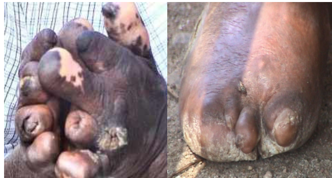
Hands and feet of leprosy victims.