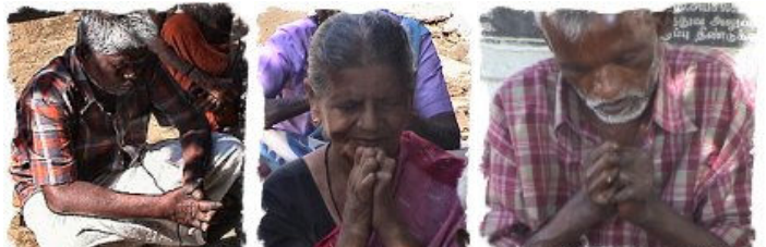
These leper's are asking Jesus to be their Lord and Savior.