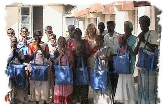
The leper's at the hospital are holding their compassion packs. Each compassion pack contains a blanket, soap and towel, bandages, sandals, toothpaste/brush, eatables, a Bible, gospel tracts and more..

world. We pulled over and called him to our van. They began to speak to him and told him to go to the government hospital on Sunday to meet them. So we were very glad to see he was among the people that day. We gave him a compassion pack and told him about the love of Jesus Christ. We also gave him new sandals for his toeless feet and some money so he could eat that day. He was not living at the hospital, but was living on the streets. When we finished speaking and handing out the packs, this man came to us with a glimmer in his eye. He said he would be back the following Sunday and he was so very thankful for all we had given him. When he walked away from us, there was almost a skip in his step. He had a new hope now, a hope he didn't have before. That hope is Jesus!