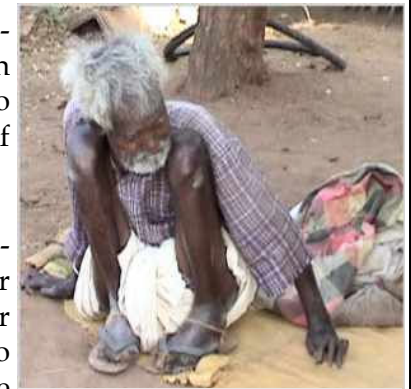
Many lepers have no home and live on the streets. This unfortunate man died due to getting infections.

India is predominately Hindu and many believe in reincarnation which is the belief that when someone or something dies their soul comes back in another body or form. In the law of Karma good is rewarded in the life to come, and evil is punished. Many believe that everyone gets what he or she deserves in life and there is no mercy towards the less fortunate. Society generally believes that a leper has been cursed by the Hindu gods because they have done something unspeakable in a past life.