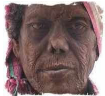
Leprosy deforms the victims face.