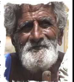
A glimmer of hope in a leper's eyes.