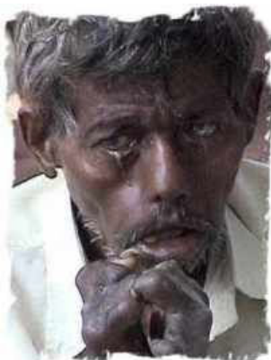
Leprosy victim with oozing eyes and deformed hands.

Worst of all, many have never even heard that there is a God in heaven that loves them and died so that they could be forgiven and experience His hope and peace. Overall, the sad reality is that they are left alone to suffer and die in their terrible state, heartbroken and emotionally shattered because they have no one to love or care for them.