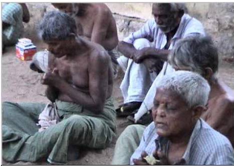
These lepers are diligently praying at a Bible study.

Every day the lepers would listen to God's word and wait anxiously for the Gospel team to return each week for their Bible study. Even before the team returns back, those lepers who have trusted in Jesus are eagerly sharing about Him to the new patients coming to the hospital and more of them are coming to a personal relationship with the Lord. The Lord is bearing witness and bringing revival among them spiritually and healing their weak bodies. One leper shared, "Within this six months since you have been coming to us God is comforting us and healing us through your