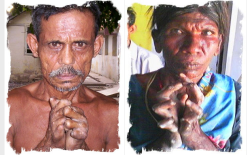
You can help to put a smile on their desperate faces...

Each leper will hear the Gospel and have an opportunity to receive Christ into their life.