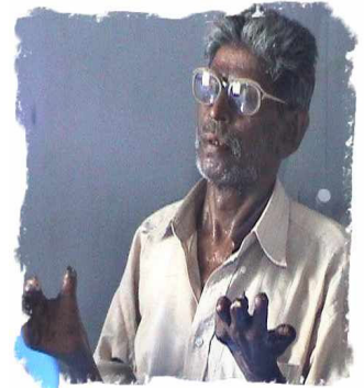
This leper is worshipping the Lord at ICII Dindigul church. Each week, lepers are coming to the church.

normal life and even work. Our goal is to buy enough land so they can grow their own fruits and vegetables. At their new home we can get medical provision for them and get them on a medicine that will cure their leprosy. They can live the rest of their lives here feeling wanted and live without starving or begging and feel the love of Jesus in their lives. We want to build them a church here and have daily Bible studies so they can grow in the Lord and have the void in their life filled with the love of the Lord Jesus Christ.